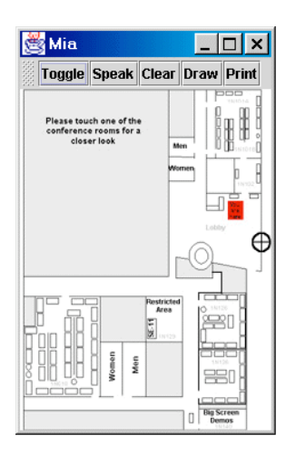
Figure 3: PDA Graphical User Interface

With this component-based approach we are able to reuse graphical components such as the trade show map between different configurations, even when it is impractical or undesirable to use identical interfaces.