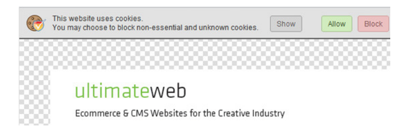
Fig. 1. Cookie dialog control from cookieguard.eu

Fair and unbiased choice design is a tricky problem. Default choices have a dramatic impact on user action [1]. Heuristic and bias reasoning theories account for a number of different situations leading to systematic bias. Biases including loss aversion (e.g., change from status quo), framing, and evaluation of options in relation to reference points (e.g., expectation and social comparison) have been well-described by Tversky and Kahneman [2, 3].